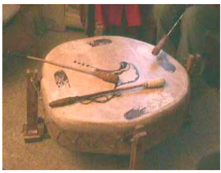
Pow Wow drum – Standing Deer